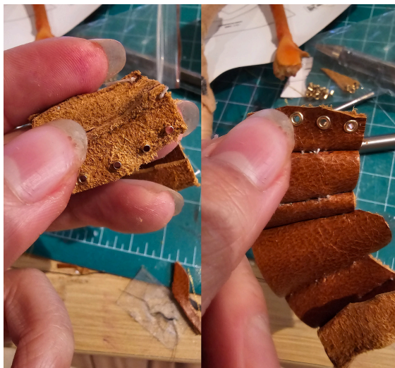
handmade corset with leather and pushed eyelets in for lace up