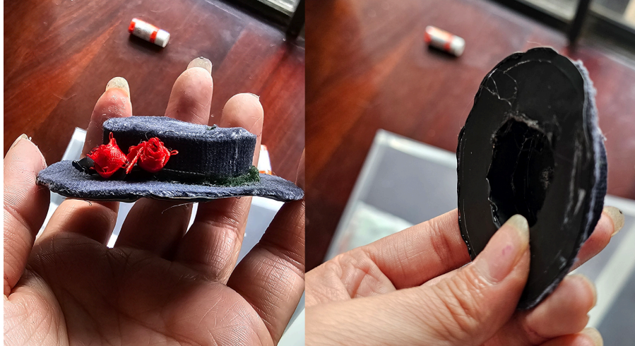
Made the rose by hand with ribbon and hat out of blue velvet. Focus on differences in texture. Made to be posable with heavy weight black aluminium foil